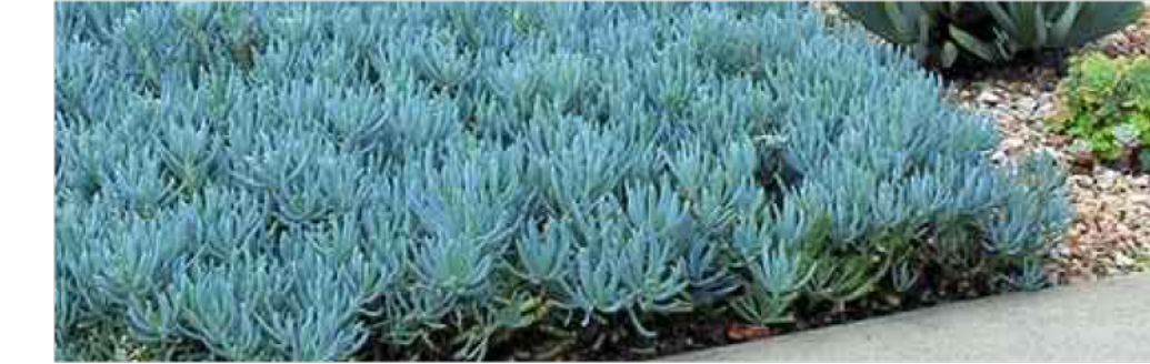
Senecio mandraliscae (Blue chalksticks)