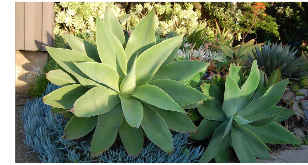
Agave attenuata (Fox tail)