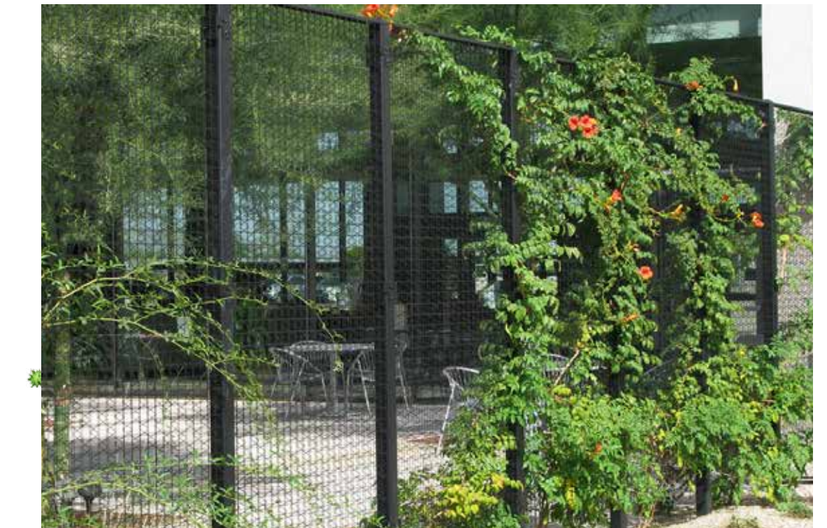
Wire fence (height varies)