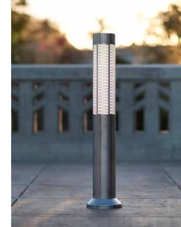
3.75' Light Column Bollards