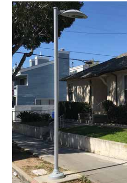
14' Standard Pedestrian Light Poles