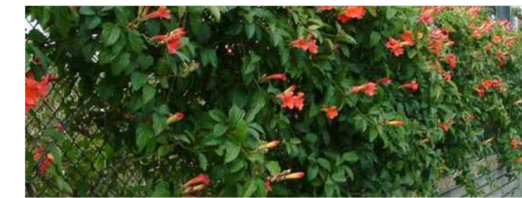
Distictus buccinatoria (Orange Trumpet Vine)