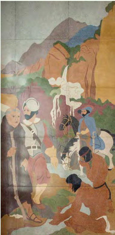
Detail of the City Hall mural.

The largest point of interpretive contention is whether the overall scene presented is objectionable. Throughout this process, Meztli encountered three different major kinds of objections and three major defenses regarding the First Peoples' portrayal.