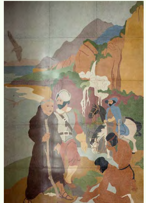
Detail of the mural “History of Santa Monica and the Bay District” by Stanton Macdonald-Wright, 1939. Southwest panel shown to the left, northwest panel shown to the right.

History of Santa Monica and the Bay District is a “petrachrome” (similar to terrazzo) mural installed on the interior walls of the lobby of Santa Monica’s City Hall building, designed by Stanton Macdonald-Wright, an American artist who spent his early years in Santa Monica. The mural was commissioned through the Works Progress Administration’s (WPA) Federal Art Project. Macdonald-Wright also acted as the administrator of the WPA project’s Southern California division, supervising numerous other artists and their projects. Macdonald-Wright’s mural was completed in 1939 along with the building itself. The City of Santa Monica owns the mural and it is part of the City’s public art collection. Santa Monica City Hall was landmarked in 1979 and the mural was mentioned in the designation. In 2011, the exterior of City Hall was given a supplemental landmark designation.