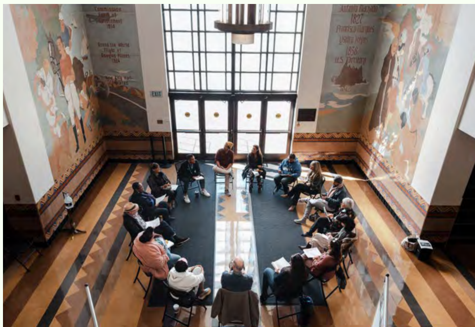
The Working Circle meets at Historic Santa Monica City Hall lobby.

The Reframe: City Hall Mural project emerged from protest and debates around the Stanton MacDonal-Wright mural in the lobby of Historic Santa Monica City Hall entitled History of Santa Monica and the Bay District . The mural has long been a point of controversy, but in 2015 a renewed effort brought public criticism for its depiction of First Peoples and settlers and its portrayal of 1930s Santa Monica as an affluent, all-white, predominantly male, center of leisure.