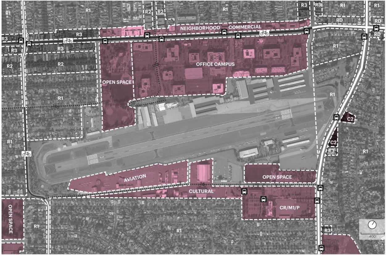
Figure 2: Airport Adjacent Land Uses

The airport is not zoned, but functions within a complex framework of federal, state, and local laws and regulations. The airport has a single runway and is designated by the FAA as a "General Aviation Reliever Airport" for Los Angeles International Airport and has no scheduled airline service.