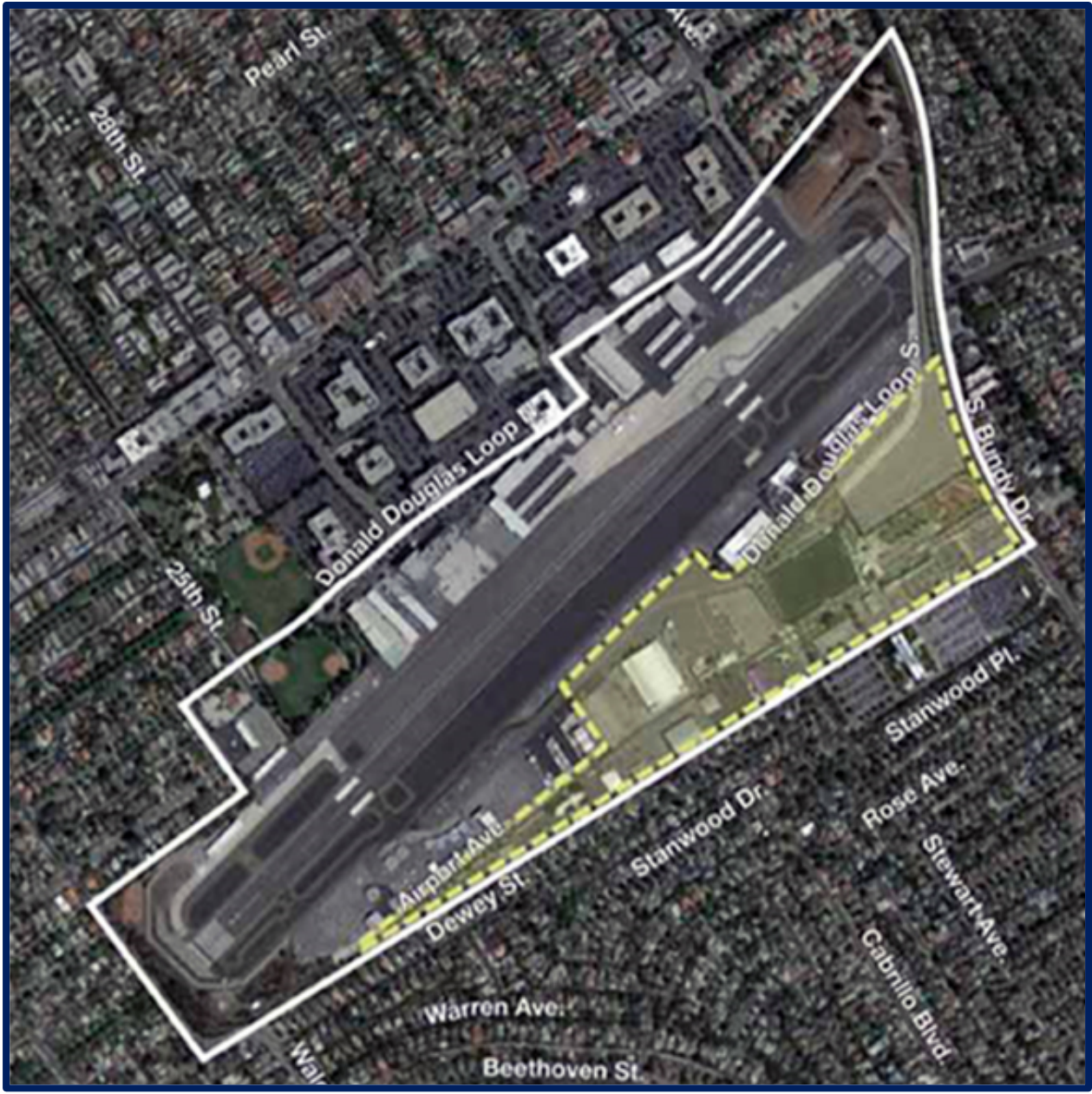
Figure 3: Residual/Non-Aviation Land is outlined in yellow.

Several past public engagement efforts that dealt with only non-aviation lands have laid the groundwork to reengage the community on the future of the entire Airport campus. Beginning in 2010, the City of Santa Monica embarked on an ambitious three-phase public outreach process to define the future vision of the airport's non-aviation lands and to better understand the perceptions, needs, and aspirations of the wider community, including current tenants, aviators, and neighbors. At the time, which was prior to the 2017 agreement between the FAA and the City to authorize closure at the end of 2028, these studies and outreach efforts focused exclusively on approximately 40 acres of "non-aviation" and "residual" land that had been identified as potentially available to host other uses which could serve the broader community including additional parks and open spaces, restaurants and cultural activities.