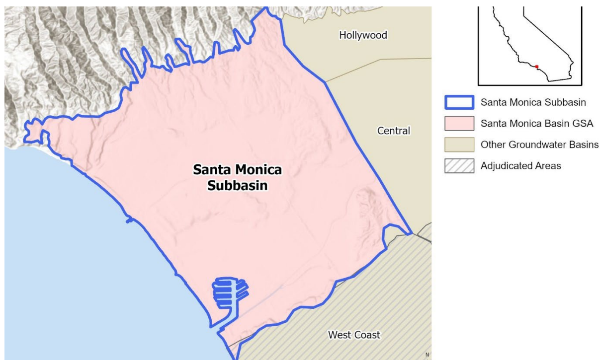
Figure 1: Santa Monica Subbasin Location Map.

The Subbasin contains approximately 50 square miles entirely located in Los Angeles County 41 and is bound by the Pacific Ocean to the west, the Santa Monica Mountains to the north Hollywood and Central Subbasins to the east, and West Coast Subbasin Adjudicated Area to the south. 42 The Subbasin is highly urbanized. Land use is predominantly residential (64%), with commercial, industrial, and public facilities accounting for an additional 23.5% of the area. Open space occupies 11.5% of the area in the Subbasin. 43 A map showing the Subbasin and adjacent subbasins is provided as Figure 1.